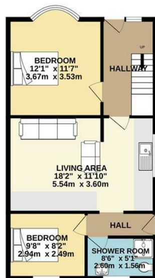
GROUND FLOOR 758 sq.ft. (70.4 sq.m.) approx.